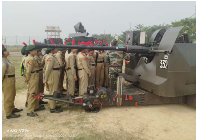
vivo V29e Bani Ghum, West Bengal, Nov 22, 2024, 12:20