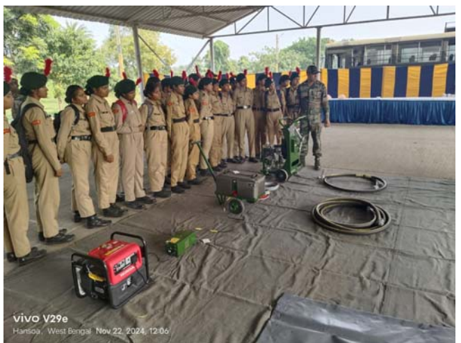
vivo V29e Hansola, West Bengal, Nov 22, 2024, 12:06