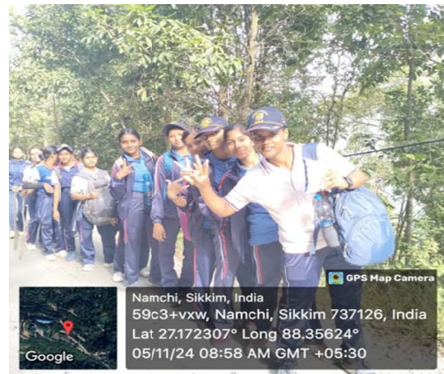
GPS Map Camera Namchi, Sikkim, India 59c3+vxw, Namchi, Sikkim 737126, India Lat 27.172307° Long 88.35624° 05/11/24 08:58 AM GMT +05:30