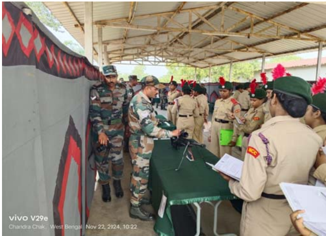
vivo V29e Chandra Chak, West Bengal, Nov 22, 2024, 10:22