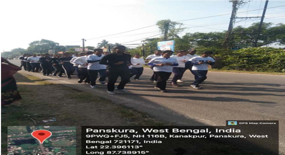
3. The students of PanskuraBanamali College (Autonomous) celebrate NCC day in 2023.