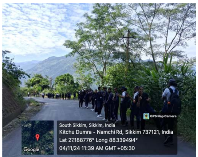
GPS Map Camera South Sikkim, Sikkim, India Kitchu Dumra - Namchi Rd, Sikkim 737121, India Lat 27.188776° Long 88.339494° 04/11/24 11:39 AM GMT +05:30