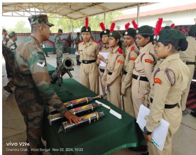
vivo V29e Chandra Chak, West Bengal, Nov 22, 2024, 10:23